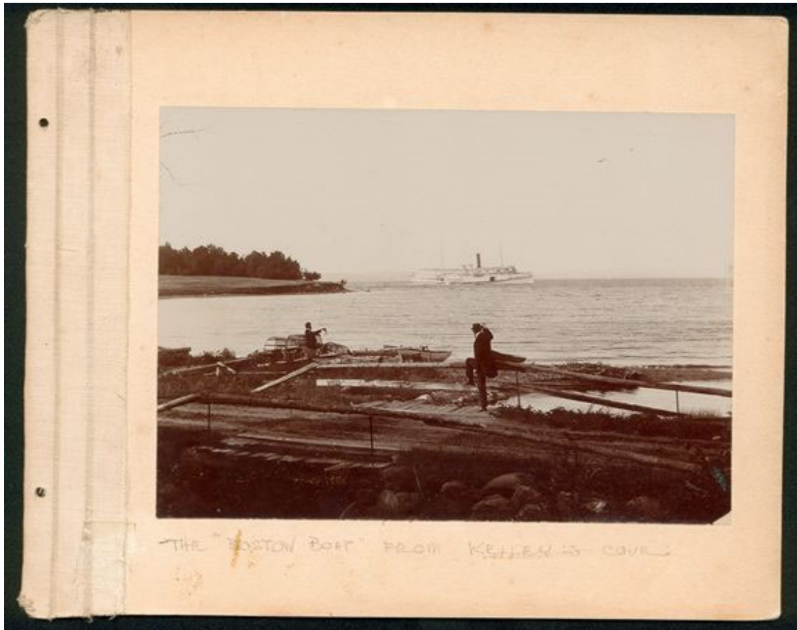
The Boston Boat at Kelley's Cove, from the BHPS collection.