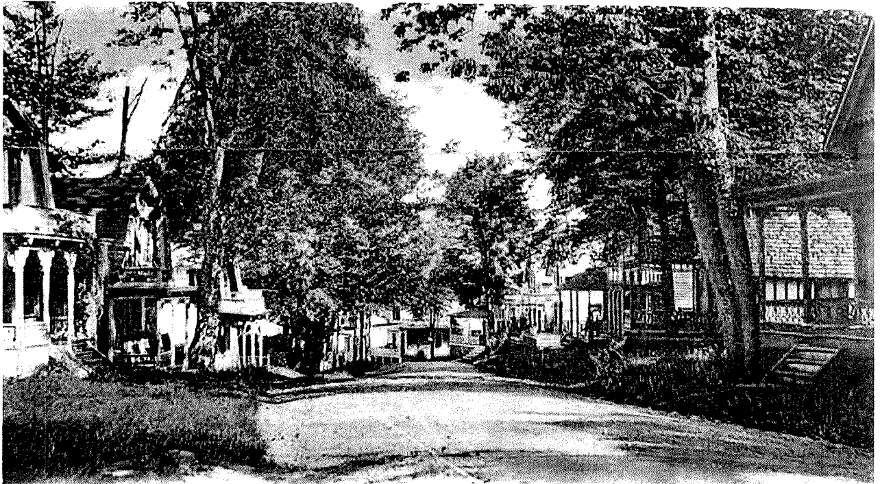
51 Northport, Me.

Dear Mother and all, I hope you are doing well and enjoying your trip to the mountains. I will see you soon.